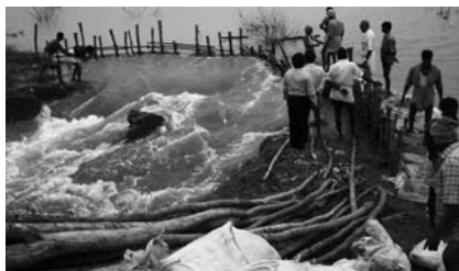
Flood water entering the roads of Chennai, India. If Noah’s Flood was only local, what would God’s promise not to send a flood again, mean?

If the Flood were local, God would have repeatedly broken His promise never to send such a Flood again. There have been huge ‘local’ floods