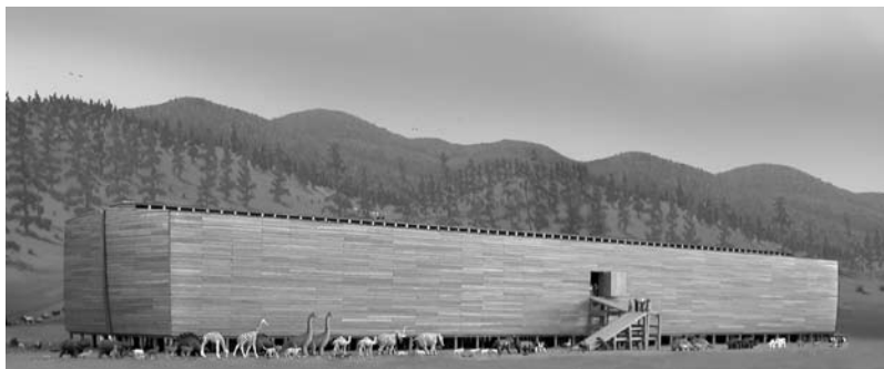
God brought to Noah all kinds of air-breathing land animals to be saved from the Flood.

number of different meanings in Scripture, but here it probably refers to reptiles. 3 Noah did not need to take sea creatures 4 because they would not necessarily be threatened with extinction by a flood. However, turbulent water carrying sediment would cause massive carnage, as seen in the fossil record, and many oceanic species probably did become extinct because of the Flood. If God in His wisdom decided not to preserve some ocean creatures, this was none of Noah's business.