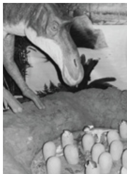
The eggs of even the largest dinosaurs were no bigger than a football, so all young dinosaurs were quite small.

One commonly raised problem is ‘How could Noah fit all those huge dinosaurs on the Ark?’ First, of the 668 supposed dinosaur genera, only 106 weighed more than ten tonnes when fully grown. Second, the Bible does not say that the animals had to be fully-grown. The largest animals were probably represented by ‘teenage’ or even younger specimens. It may seem surprising, but the median size of all animals on the Ark would most likely have been that of a small rat, according to Woodmorappe’s up-to-date tabulations, while only about 11 percent would have been much larger than a sheep. See also Chapter 19, pp. 230 ff.