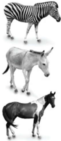
Zebras, donkeys and horses—probably one biblical kind.

For example, horses, zebras and donkeys are probably descended from an equine (horse-like) kind, since they can interbreed, although the offspring are largely sterile. Dogs, wolves, coyotes and jackals are probably from a common canine (dog-like) kind. All different types of domestic cattle (which are clean animals) are descended from the aurochs, 6 so there were probably at most seven (or possibly 14) domestic